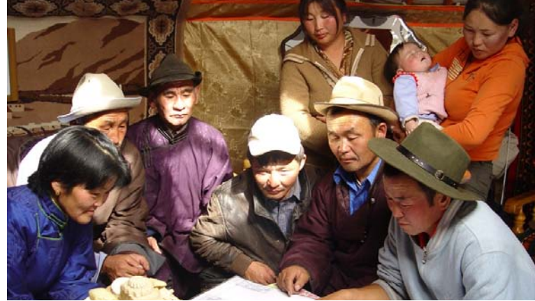
Consulting on Sustainable Land Management.

In close collaboration with other UN agencies, UNDP is supporting the Mongolian Government in developing and implementing sound MDG related policy. National MDG reports, prepared with broad participation from non-government organisations, academics, the media and civil society, assess and monitor progress in achieving national goals. Local communities in six pilot provinces have been empowered to assess their own develop-